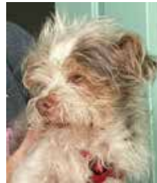
Ellen Hack 20 Beaumont Lane

Say hello to Dudley at 20 Beaumont whose owner recently moved to Plantation Oaks from the villages. Ellen Hack and Dudley are looking forward to relaxing in our quiet community and meeting new friends.