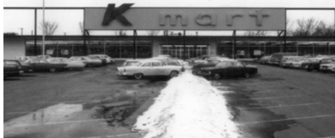
The first store of Kmart in Garden City. Picture dated March 1962.