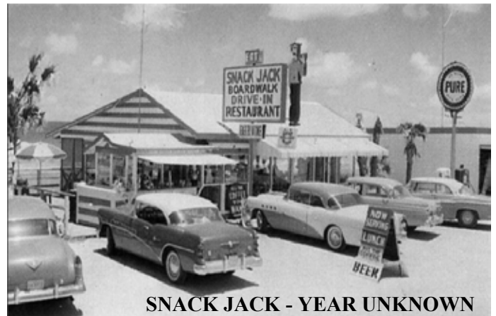
SNACK JACK - YEAR UNKNOWN

What only remains of my Florida is its name