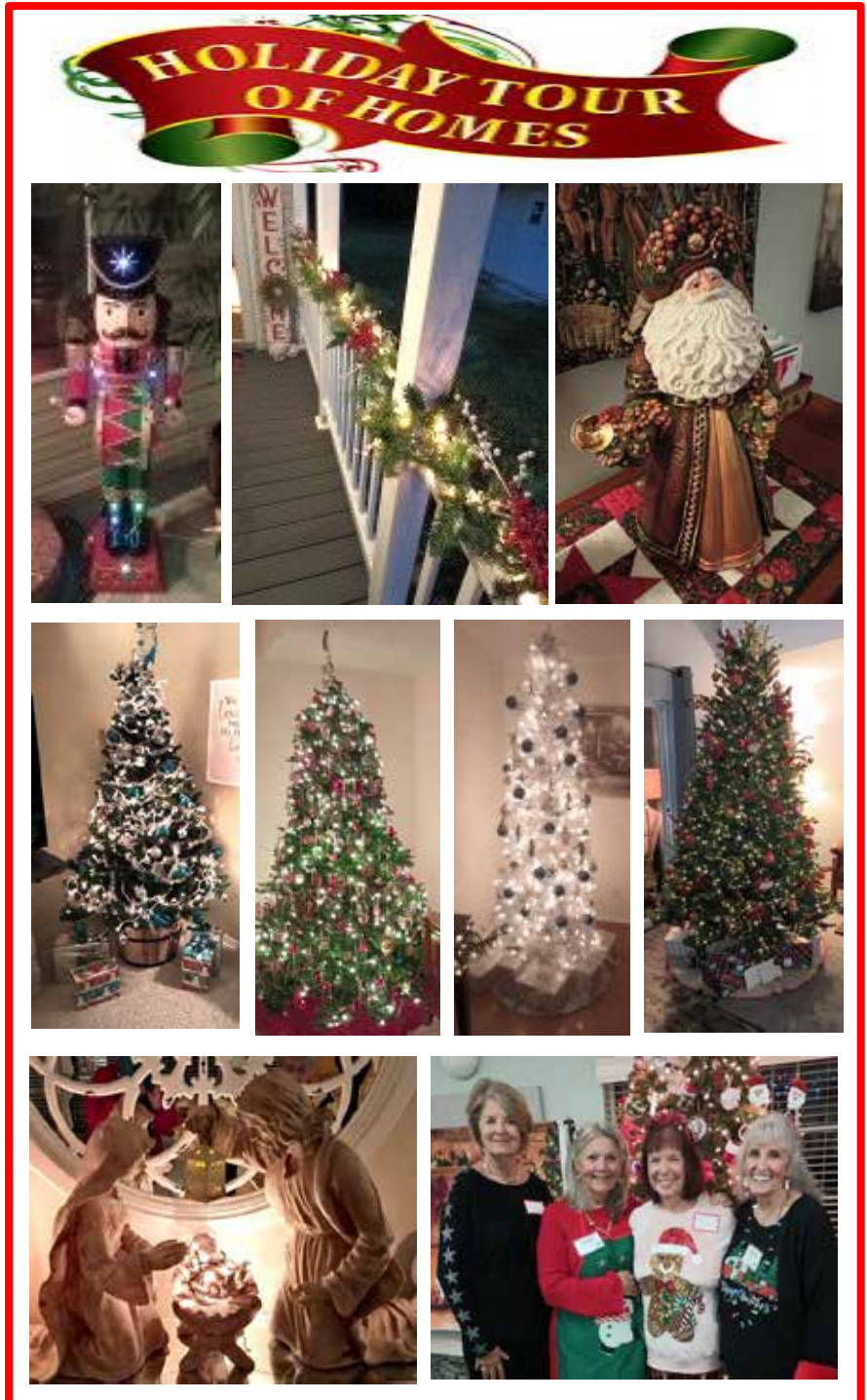
Tour of Plantation Oaks Homes, 12-8-2023. See page 3.

FOR ADVERTISING INFO CONTACT 941-375-3699