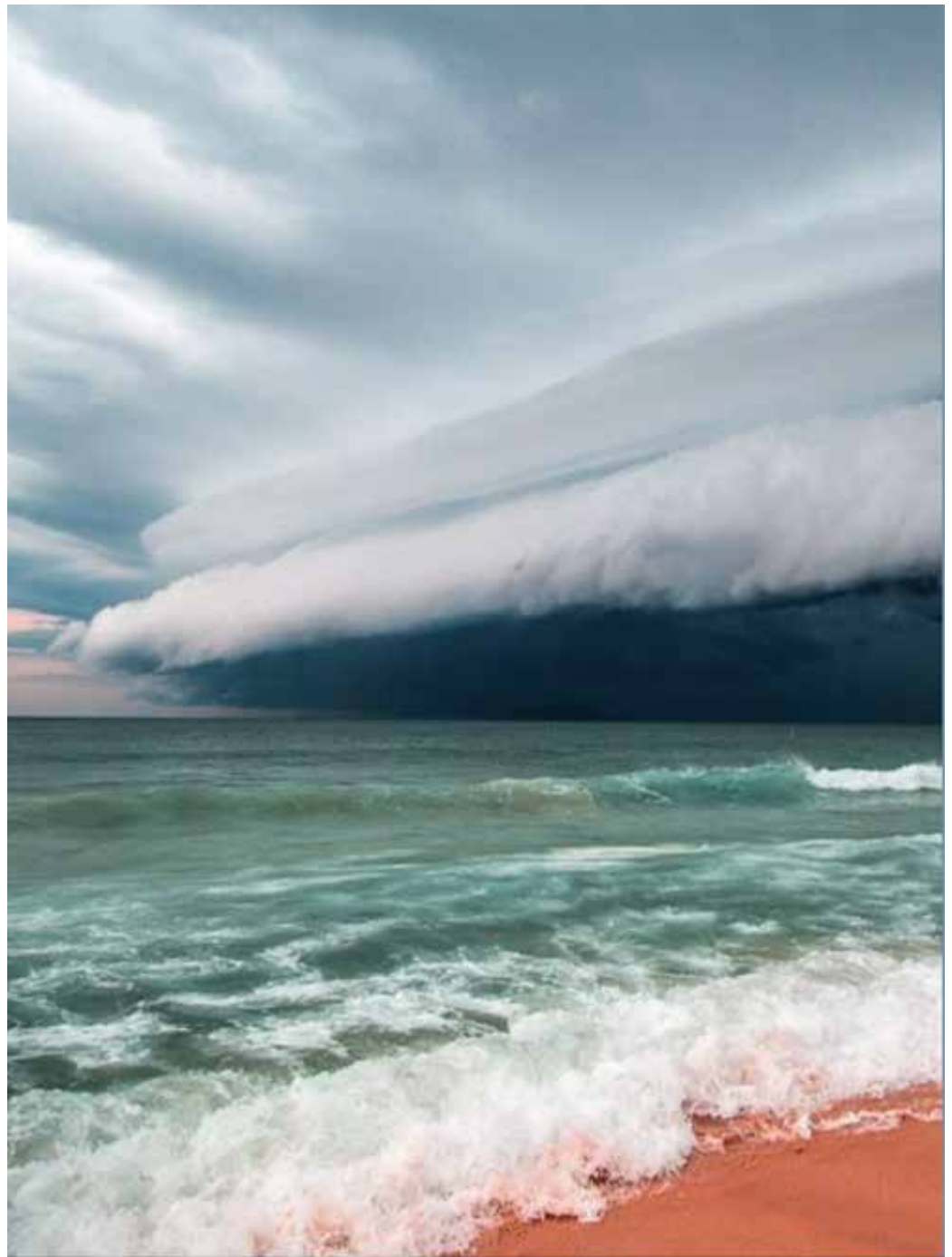
SHELF CLOUD AT FLAGLER BEACH - a low, horizontal wedge-shaped cloud, associated with a thunderstorm gust front (or occasionally with a cold front, even in the absence of thunderstorms).

FOR ADVERTISING INFO CONTACT 941-375-3699