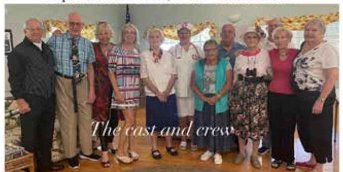
The cast and crew